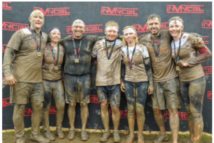
Some of the triumphant HWA team celebrate the end of the race