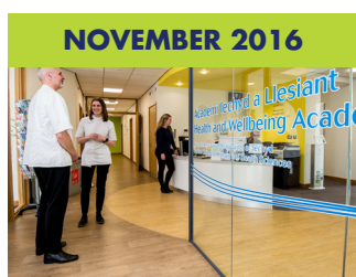
Open for business: the HWA reception area