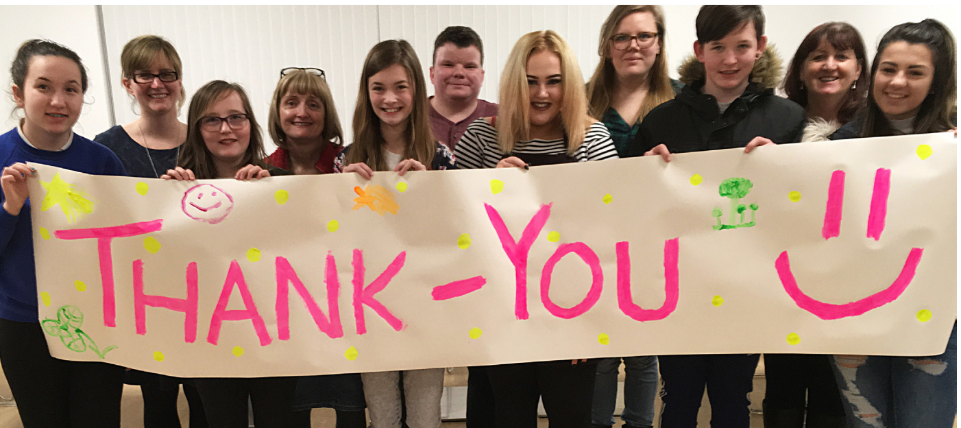
Children from the Cruse Bereavement Care sessions say thank you to the Academy mud run team