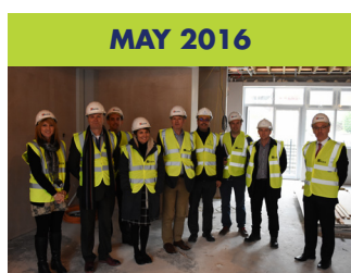
The HWA team get a progress update on refurbishment

"It is a great example of health and science working together with patients to improve the health and wellbeing of their community."