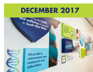
Communicating the Academy's mission with bright new signage