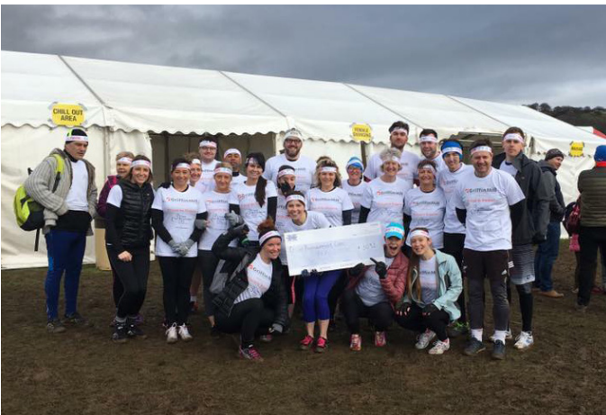
The HWA team with their Cruse donation cheque

"The group has really helped [my daughter]. She doesn't feel as if she is the only child to have gone through this. She looks at things differently now"